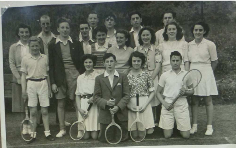
Some of the first Club Members.

Holiday. Some members of the Club spent ten days walking in North Wales.