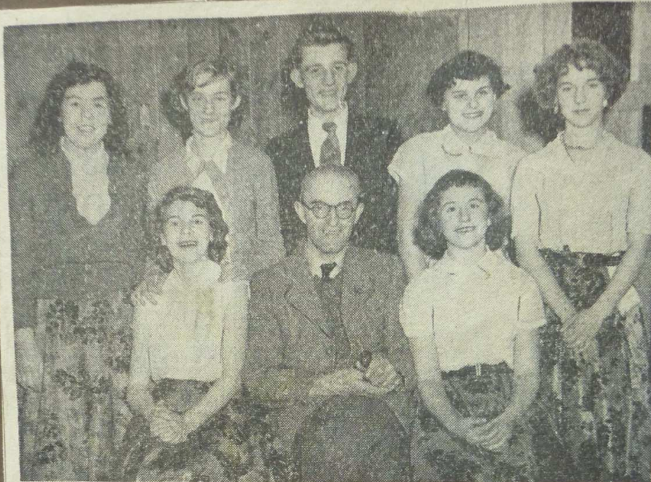
The Faringdon Town Youth Club folk dance team which was placed in class four.