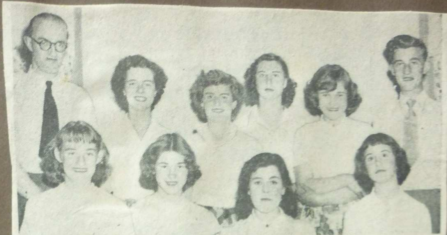
Faringdon Town Youth Club's square-dance team which gave a demonstration at the club, on Saturday.