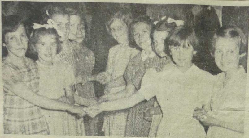
Dancers of Faringdon Town Youth Club Junior Country Dancing Group ready for the "Haymakers Jig" at the Cora Exchange, Faringdon, on Wednesday.