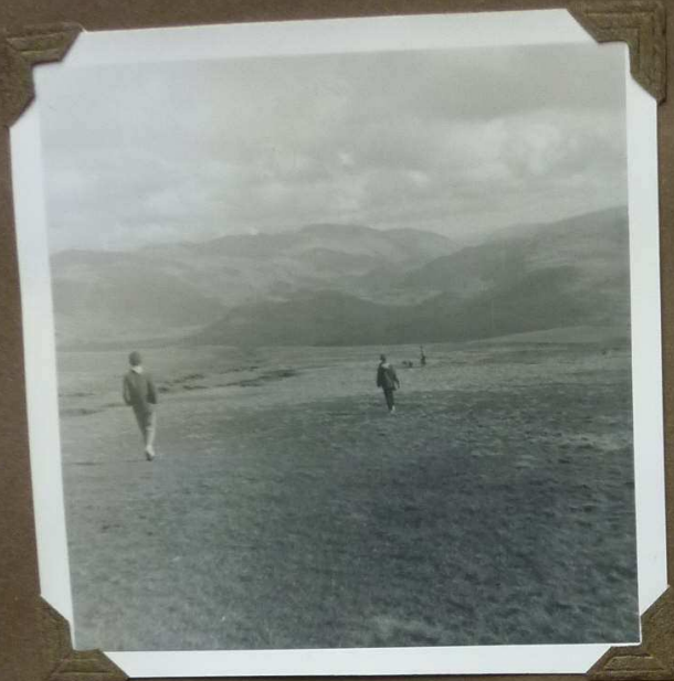
In the Lake District Easter 1961.