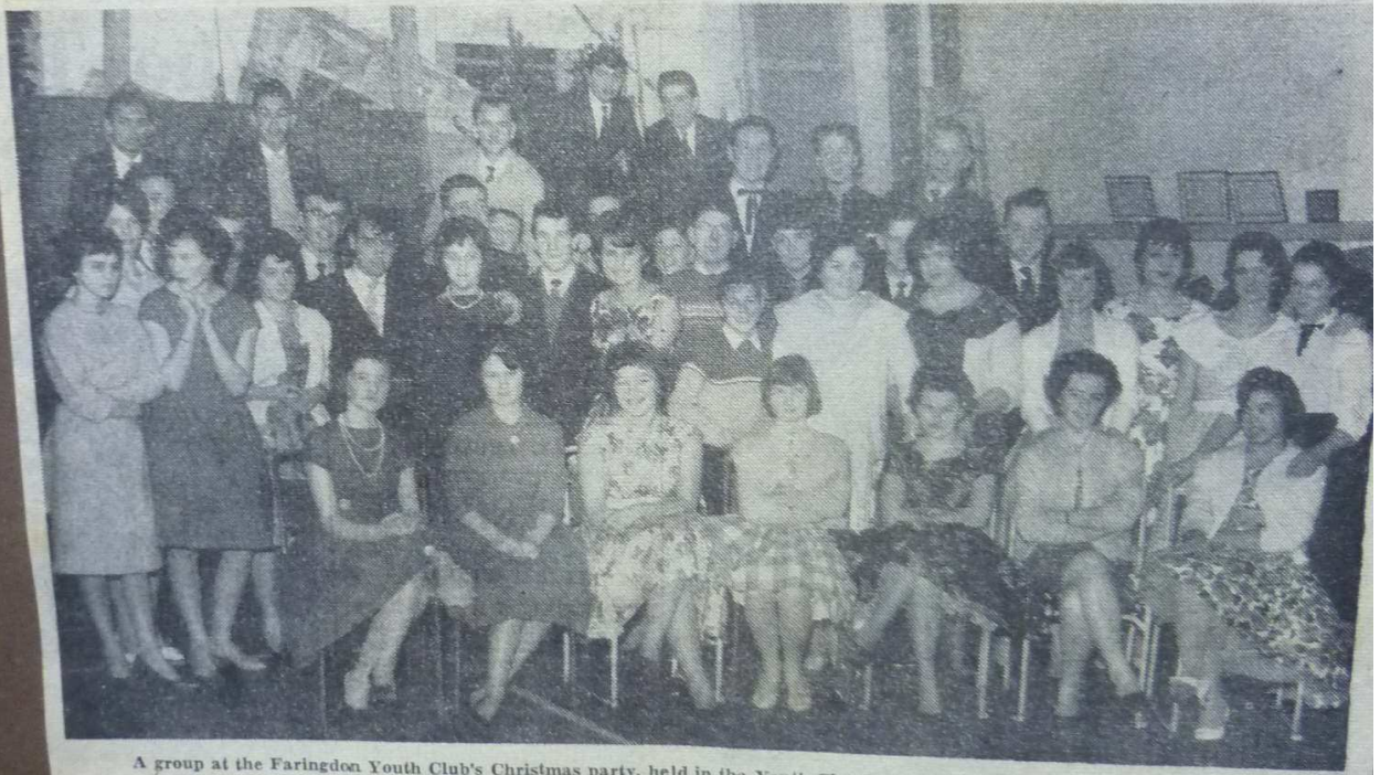
A group at the Faringdon Youth Club's Christmas party, held in the Youth Club, Stanford Road, on Thursday evening.