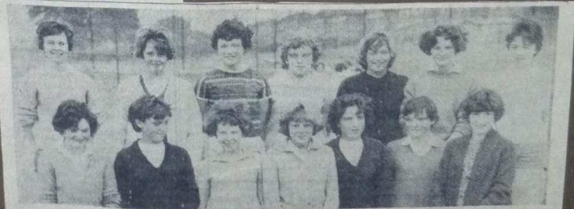
Faringdon Youth Centre teams who took part in Monday's netball tournament at Wantage. The juniors are in front, with the seniors behind.