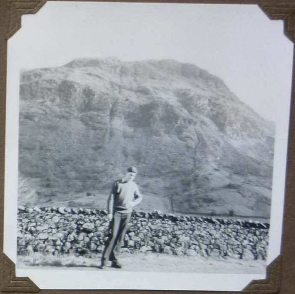
At Abingdon June 1960