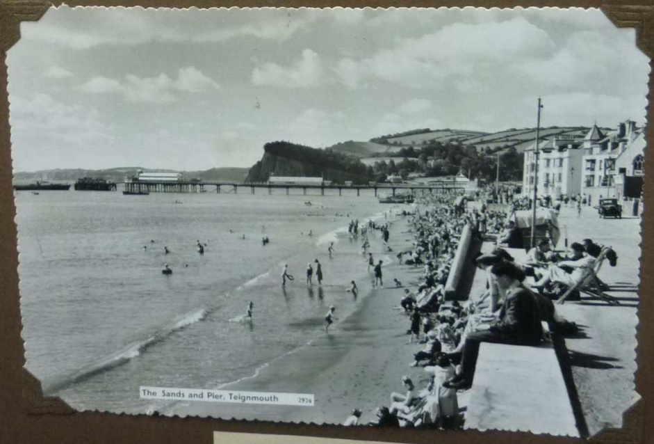
At Teignmouth August 1961.