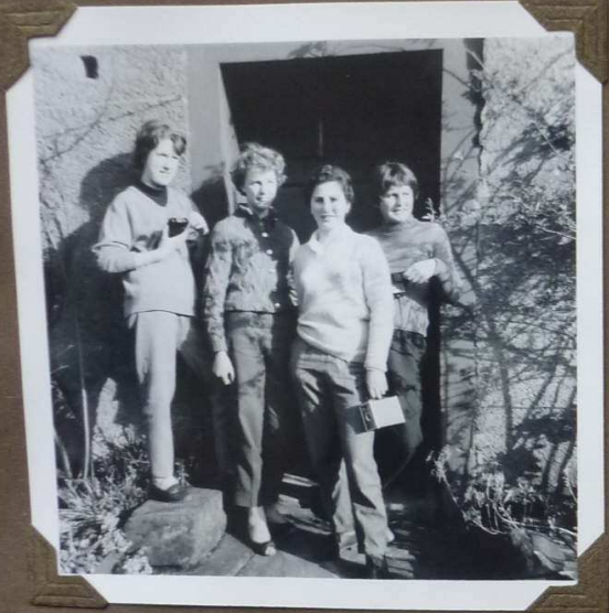
In the Lake District Easter 1960.