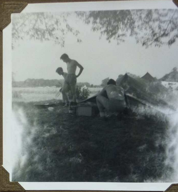
Camping June 1961.