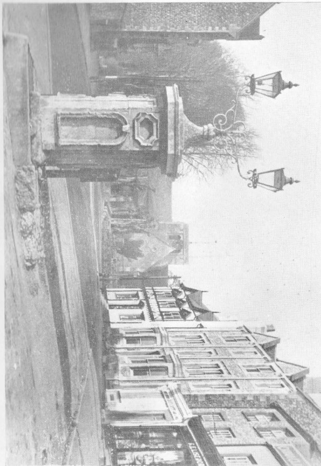
“TIME CONSECRATES, AND WHAT IS GREY WITH AGE BECOMES RELIGION.” —Coleridge.

9.30 p.m. to 2 a.m.—Dance in Corn Exchange.