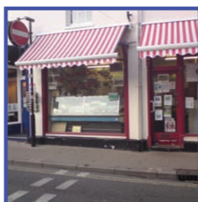
G & G Butchers