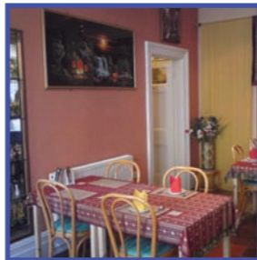
Bangkok Kitchen (Thai Restaurant)